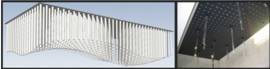
ABOVE - RENDERING OF PROPOSED LOBBY CEILING AND INSTALLATION IN PROGRESS. SCHEDULED COMPLETION JUNE 2010.