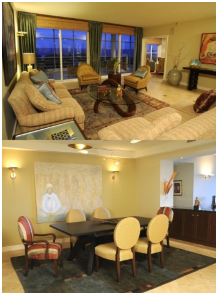
Above: Interiors of a condominium blending traditional elements with contemporary pieces.