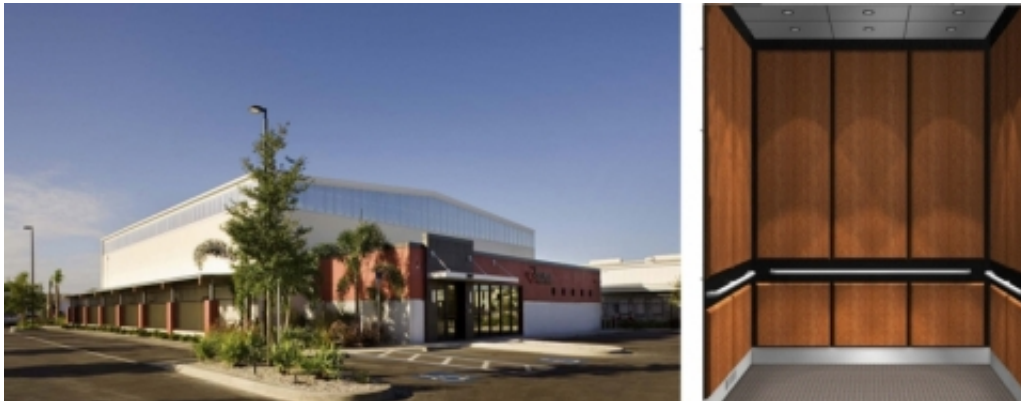
ABOVE- CAT DEPOT (COMPLETED OCTOBER 2009) AND ELEVATOR CAB OPTION BY RETRO ELEVATOR CAB COMPANY.