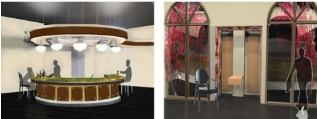
ABOVE- RENDERINGS CREATED FOR A NEW RETAIL STORE / CAFE. INTERIOR DESIGN AND ARCHITECTURE WAS HANDLED BY THE SCHIMBERG GROUP.

Please visit our blog to participate in discussions about architecture, sustainability, and our built environment. TSG-Blog