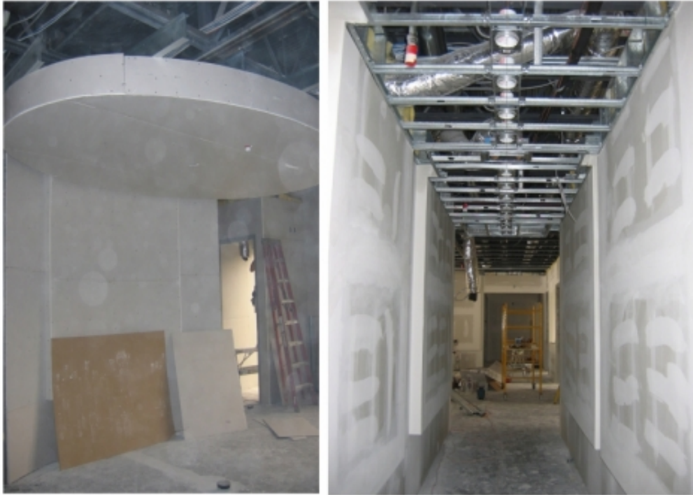
EXAMPLES OF COMMERCIAL TENANT IMPROVEMENT PROJECTS CURRENTLY UNDER CONSTRUCTION BY THE SCHIMBERG GROUP

Please visit our blog to participate in discussions about architecture, sustainability, and our built environment. TSG-Blog